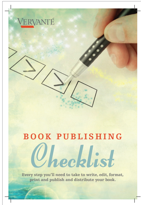
Postcard Side 1