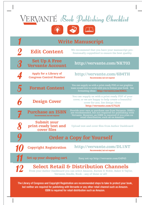
Postcard Side 2