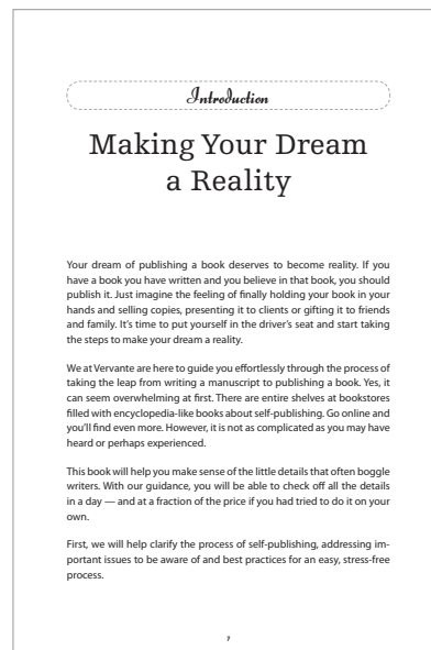
Book page trimmed to size

We also require a PDF of the cover. A perfect bound cover PDF is one image containing the front panel, spine and back panel. The spine width is calculated based on the number of sheets in the book. You can find a template for your book here .