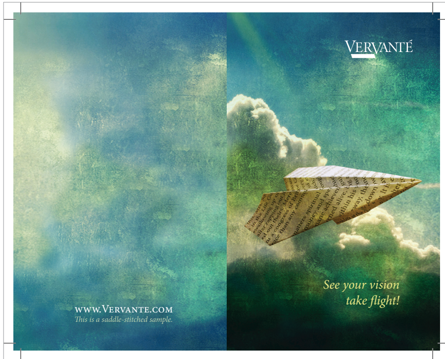
Full cover spread (front and back) for a saddle-stitched cover with bleed and crop marks

Book Formatting: Vervante offers book formatting so if you have your content ready but it is in MSWord, we would be happy to help with formatting, headers, footers, pagination, table of contents, etc. You can find more information here .