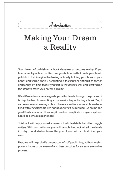
Book page trimmed to size

We also require a PDF of the cover. You can find a template for your saddle-stitched booklet here .