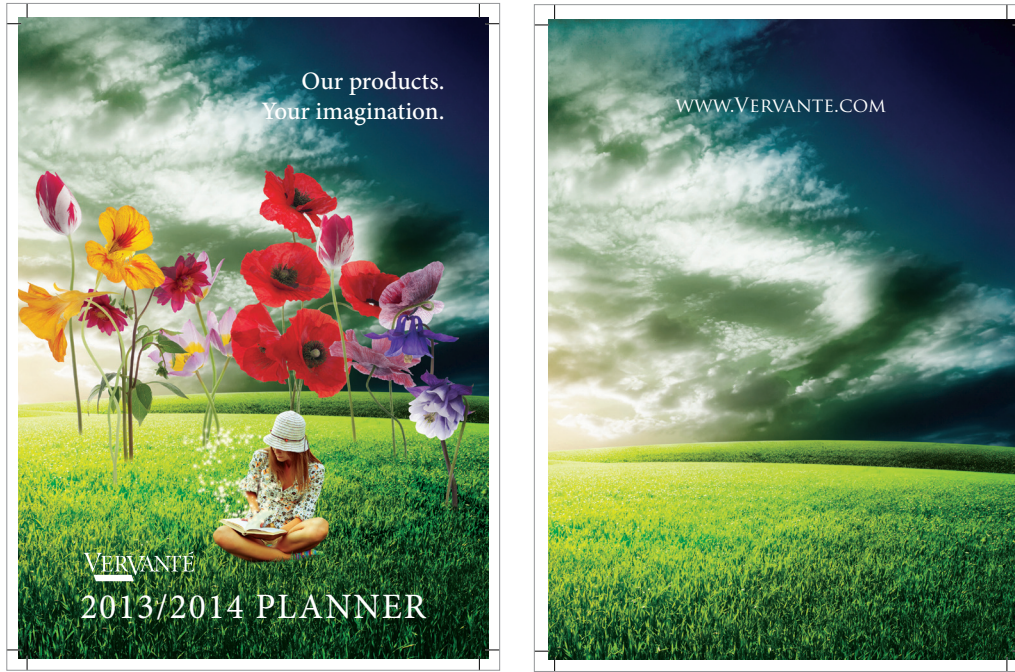
Front and back cover of a spiral-bound book, with bleed and crop marks.

We also require a PDF of the cover. You can find a template for your spiral book here .